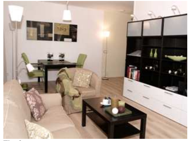
Fig. 2. Comfort, safety and Low vision dwelling, view of the living room, photographer Max Koninkx, The Netherlands Association of Universities of Applied Sciences (HBO-Raad).

knowledge about the use of smart technologies at home for ageing-in-place. In addition, more understanding was gained about how potential dwellers such as persons with